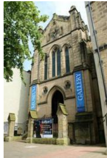
Bailiffgate Museum & Gallery front from path to Alnwick Castle