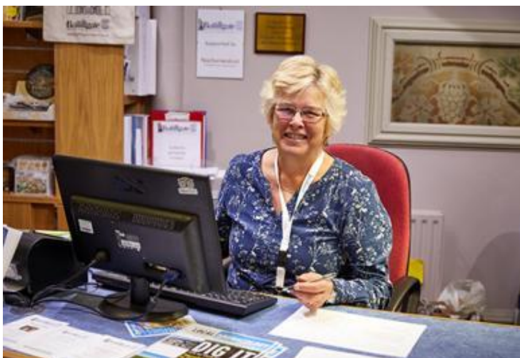
Welcome to Reception Bailiffgate Museum & Gallery