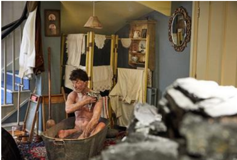
The miner takes a bath Ground Floor Bailiffgate Museum & Gallery