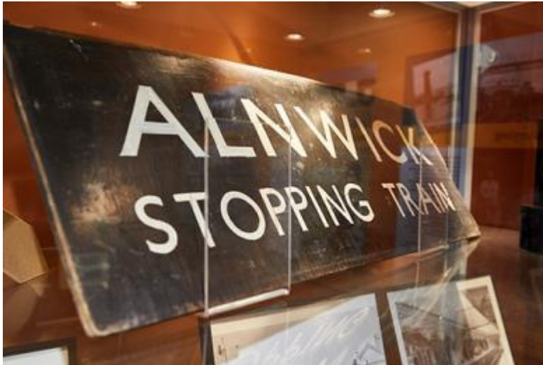
Sign from Alnwick Station when last open Bailiffgate Museum & Gallery