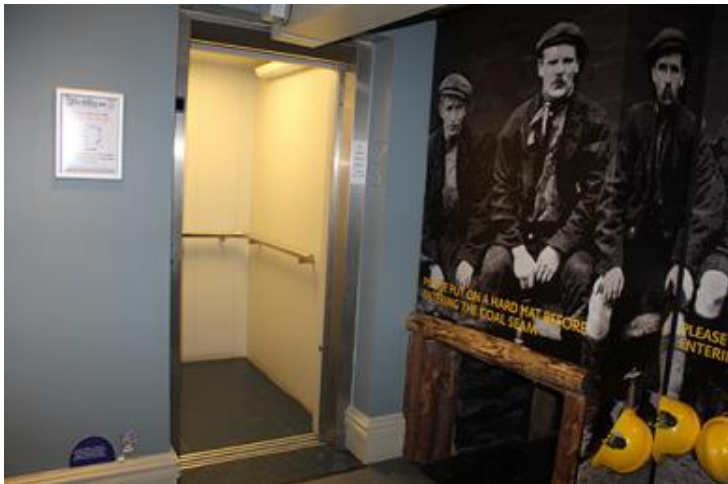
Lift open at ground floor entrance from street Bailiffgate Museum & Gallery