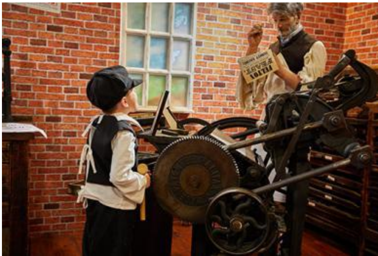
Davison's Print Shop Bailiffgate Museum & Gallery