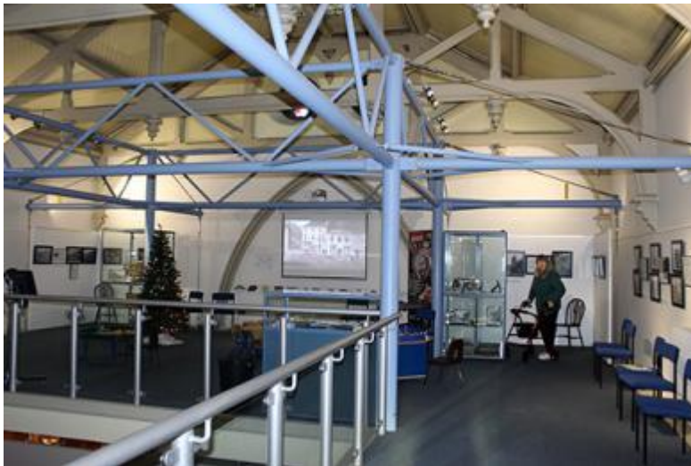
Part of Gallery Area second floor Bailiffgate Museum & Gallery