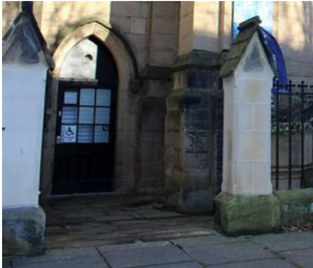
Bailiffgate Museum & Gallery alternative entrance avoiding any stairs