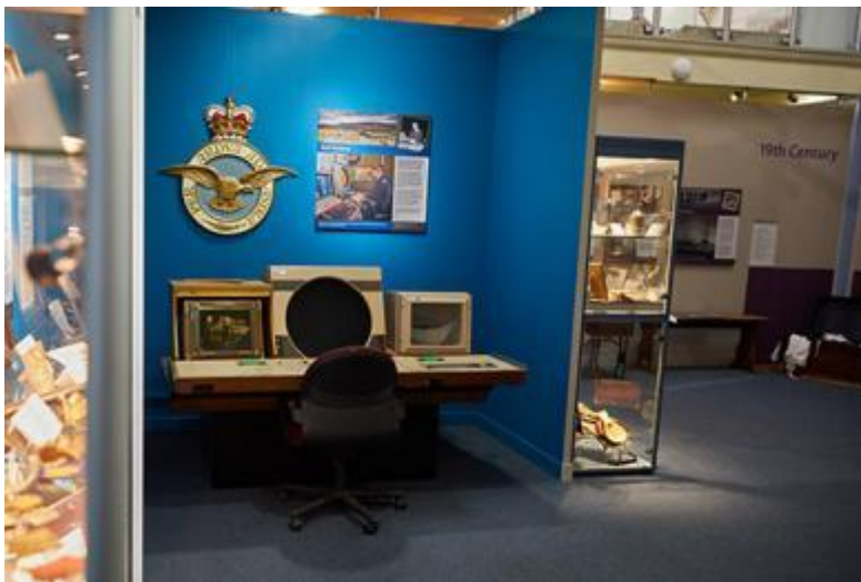
RAF Boulmer display Bailiffgate Museum & Gallery