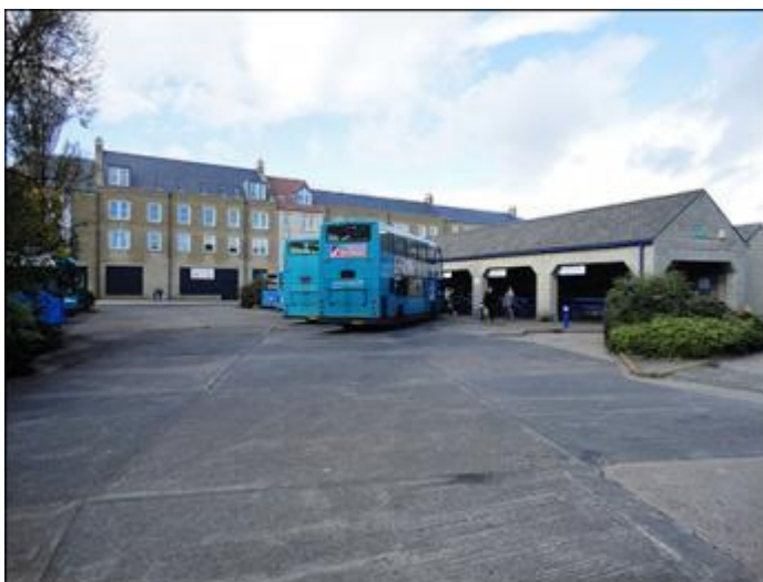
Alnwick Bus Station