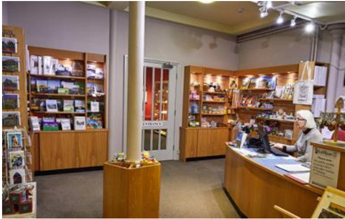
Bailiffgate Museum & Gallery Shop