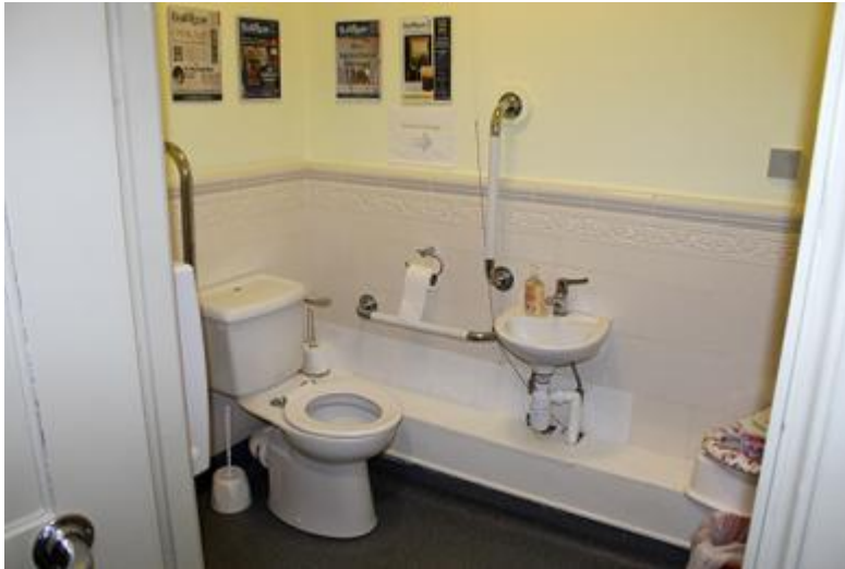
Disabled Toilet Bailiffgate Museum & Gallery

740mm from the ground with a suitable tap for disabled use. There is also a drop-down baby change facility. paper towels are available as are sanitary disposal facilities.