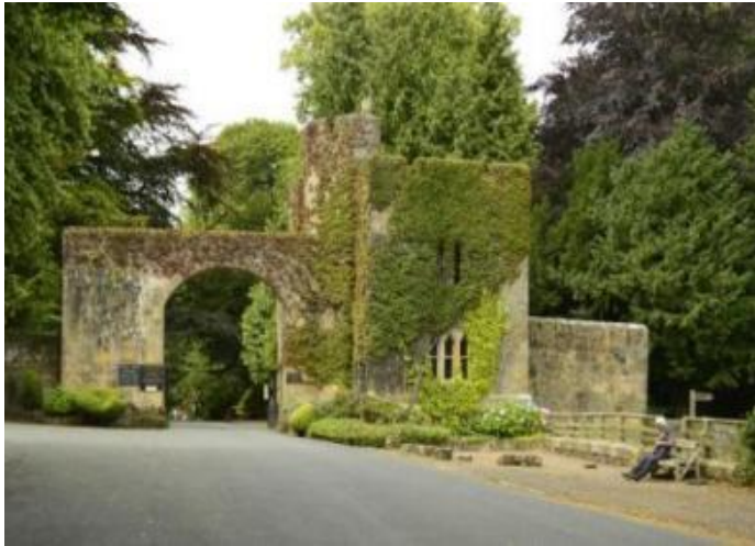
Hulne Park entrance gates Alnwick