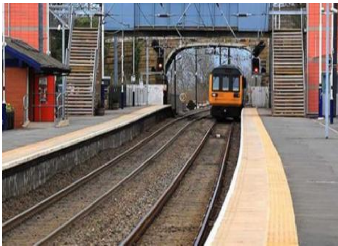
Alnmouth Station showing (pink) passenger lifts each side