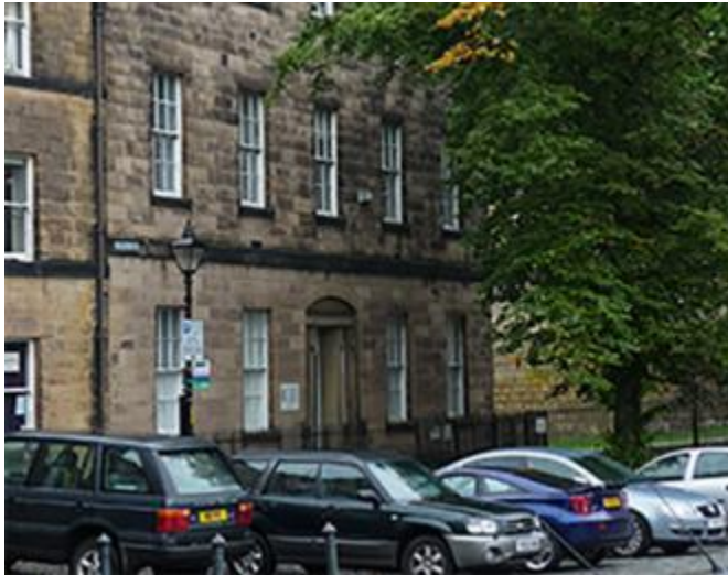
Some of the parking spaces in Bailiffgate